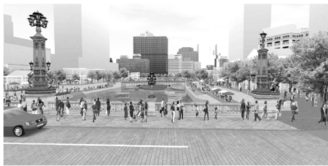
Figure-3 Image of the Nihonbashi Restoration Project (Plan D) (5)

Plan C transferring expressway into the renewal buildings can maintain the expressway network although it needs a greater amount of transfer cost. Plan D transferring expressway to the underground can also maintain expressway network although it also needs a greater amount of cost. Plan D can achieve not only road network renewal but also revitalizing river, road space and urban renewal. Plan D has the largest ripple effects among these plans. The most dominant plan is transferring expressway to the shallow underground. In that case the length of underground is about 1.4 km and its adjacent part of above ground is about 0.8 km (figure-2).