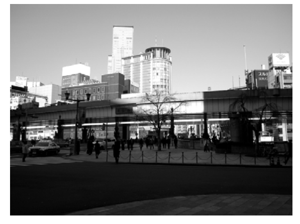
Fhoto-4 Nihonbashi covered by the Elevated Expressway

In recent years many movements about Nihonbashi have been generated. For example "Conservation Society of Nihonbashi" was set up in 1968 by local citizens. "Revitalizing