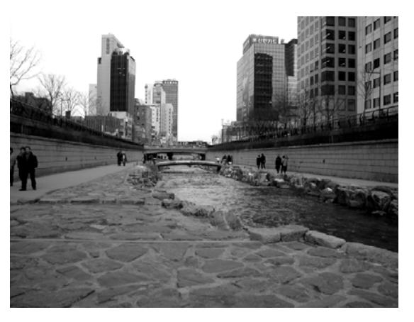
Fhoto-1 Restored Cheong Gye Cheon

Engineering works started on the first of July in 2003 and was completed on the first of October in 2005. The construction time was only two years and three months. It was amazing speed especially in view of the large scale of the project. The cost of the restoration project was 378 billion won in total, of which