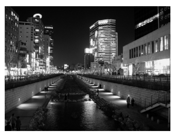
Fhoto-3 Restored Cheong Gye Cheon at night