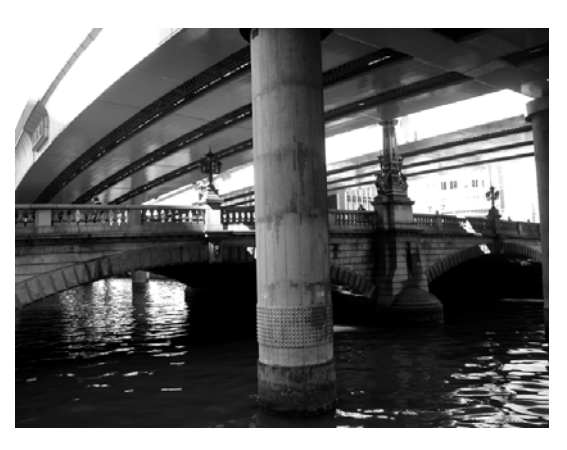
Fhoto-5 Nihonbashi covered by the Elevated Expressway

Nihonbashi" was declared on October 12 in 1983 by citizens' groups. Minister of Land, Infrastructure and Transport said on March 14 in 2001 that "Nihonbashi is the face of the capital city, Tokyo, and the project should be tackled by the central government". Then the Ministry set up the "Committee for Studying Metropolitan Expressway in Central Tokyo" April 2001. "Advisory Committee for Studying Street and Landscape at Nihonbashi" was also set up in August 2003. An idea competition was held in 2004, at which many ideas were proposed from around the whole country.