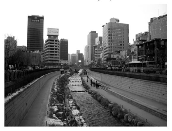
Fhoto-2 Restored Cheong Gye Cheon